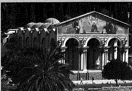
Church of All Nations

Tour operator reserves the right to alter any part of this tour itinerary without prior notice.