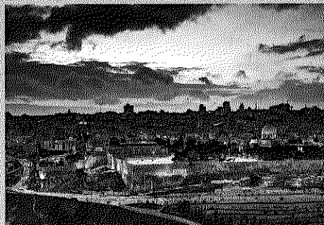
Sunset over Jerusalem