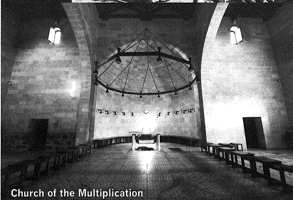
Church of the Multiplication