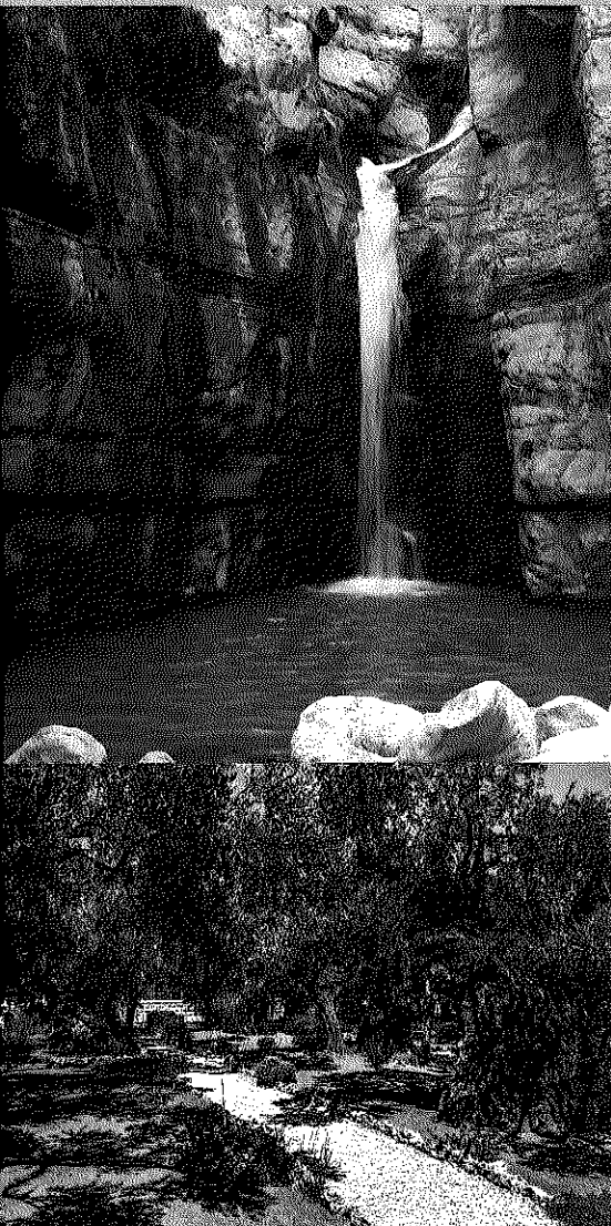
Ein Gedi Falls (top)