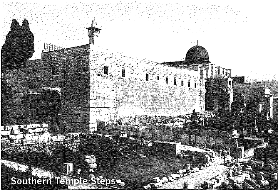
Southern Temple Steps

Scheduled International Flights • Top Quality Four Star Hotels • Israeli Buffet Breakfast & Dinner Daily • Top Guide with In-Depth Knowledge of the Old and New Testaments • Private Air Conditioned Motorcoach • Visits to the Major Historical Sites • Boat Ride on the Sea of Galilee • Certificate of Your Pilgrimage to ISRAEL .....and more!